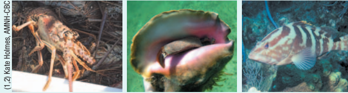
The principal commercial fisheries in The Bahamas are crawfish, conch, shallow-water scale fish (groupers, jacks, snappers, and grunts), sponge, stone crab, queen helmet shells, and deep-water scale fish (red snappers).

Vessel owners and operators earned some B$102.7 million in 2002. Additionally, export of crawfish, scale fish, and inedible marine products (such as sponge and helmet shells) resulted in US$99.5 million in foreign exchange in 2002.