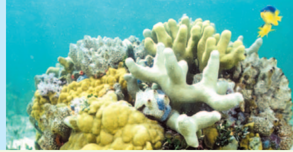
Katie Holmes, AMNH-CBC

A network of fully-protected marine reserves, such as the group of reserves being set up throughout The Bahamas, can be more beneficial in protecting marine life than any reserve can by itself. Together the reserves in a network should include the full range of marine habitats, be large enough and well-connected enough to protect marine populations, and also have the support of the human communities who use the marine resources.