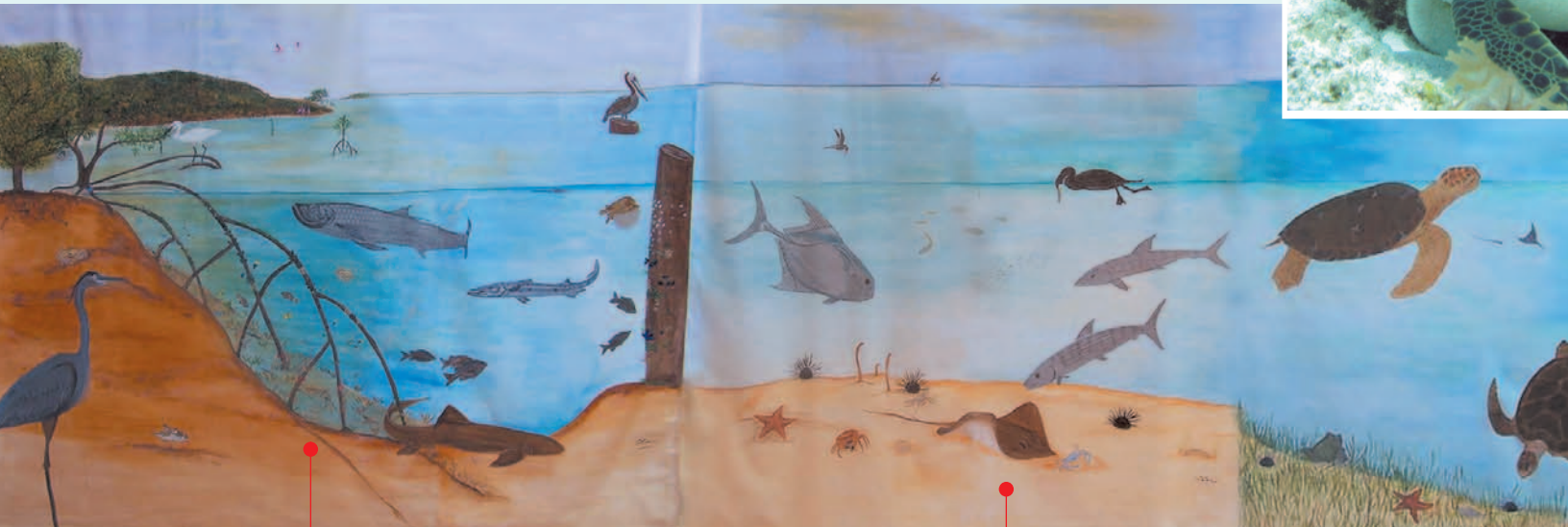
Adapted from the mural created by Charlene Carey for the Fully-Protected Marine Reserves Public Exhibition

Mangroves are trees that are found in the transition zone between the land and the sea. They form an important habitat for many juvenile fishes (they are a nursery for about 80% of commercially important fish species) and for other animals, such as lobsters, land crabs, bats, and birds. Mangroves also serve as a filter and trap sediments, thereby protecting coral reef habitats.