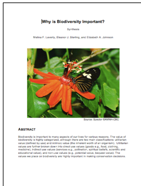
Figure 2. Cover page of NCEP module Why is Biodiversity Important?

For Synthesis and Case Study Narrative documents, please use the following formatting for a cover page (Figure 2). Begin with the formatting above. After the authors’ names and institutions, break 3 lines and add a picture and source. Break 3 lines again and write “Abstract” using Heading 2, followed by a single line break, then the abstract text in normal font (Arial 12 point). Do not include a page number on the cover.