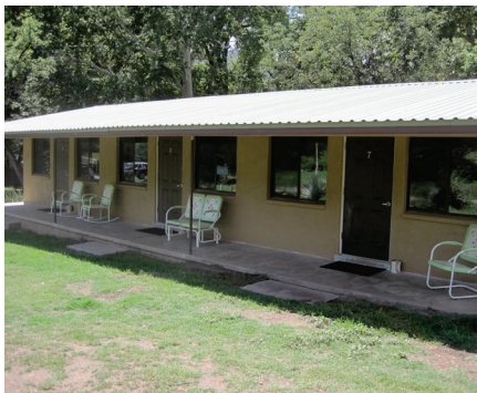
One of the three remodeled triplex units

Our newly remodeled triplexes provide living space for researchers, course instructors, and naturalists.