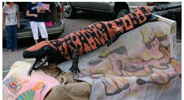
This large beast won a prize in the parade!!