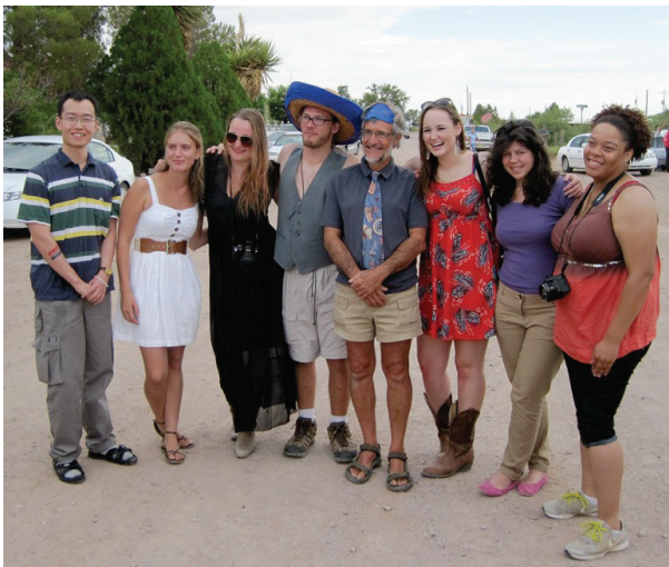
SWRS volunteers at the fourth of July parade in Rodeo, New Mexico

Please forward, and notify sender of change of address.