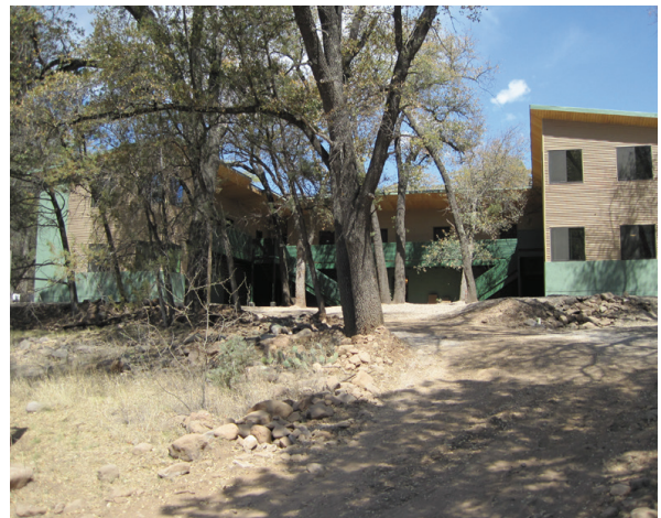
Newly constructed dorm

Fortunately in 2011, the SWRS received funding through a grant from the National Science Foundation and a generous donation from David Rockefeller to build a new dormitory and upgrade the aging infrastructure of our nine existing housing units. These advances in infrastructure provided safer and more energy efficient housing for all station users.