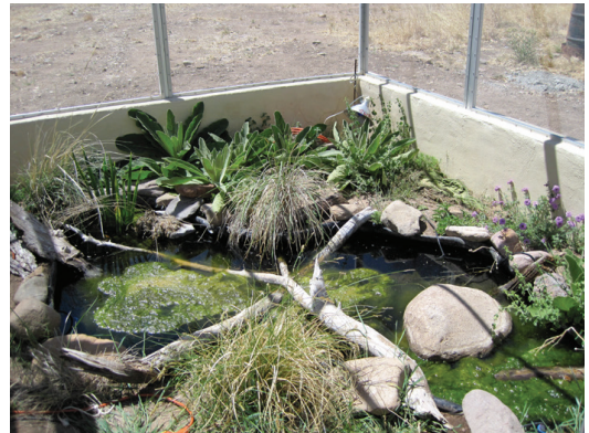
Pond in head-starting facility

The Chiricahua Leopard Frog (CLF) was federally listed as a threatened species in 2002 and a recovery plan was adopted in 2007 to help reestablish this species into previously occupied habitats. Throughout its range, the frog's decline was a result of reduced quality and quantity of its riparian habitats -- including but not limited to -- introduction of non-native species, stream channelization, mining, catastrophic wildfires, drought, and disease. Unlike spadefoot toads (featured in our 2011 newsletter) that prefer an ephemeral pond to develop from egg to frog, the CLFs require a permanent water source for the egg and tadpole stages.