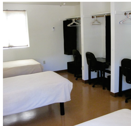
Corner dorm room

http://research.amnh.org/swrs/visitor/accommodations