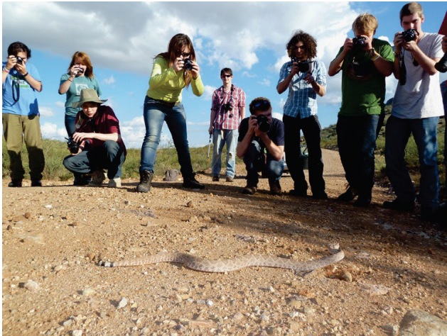
A Western Diamondback is the star of the show for class participants

Reptiles and amphibians make a minor contribution to the biodiversity of the British Isles, and consequently, they rarely feature prominently in University curricula. However, over the last 19 years, three faculty with herpetological backgrounds have developed Bangor University (North Wales, west coast of Great Britain) into the UK's main centre for herpetological studies, culminating in the creation of a specific undergraduate degree in Zoology with