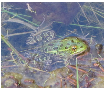
Head-started frog released into Spring Box Pond

In October of 2011, we proudly transferred 52 juvenile frogs and 284 tadpoles from the enclosed ponds to a pond on station grounds called the Spring Box Pond (SBP). By 2012, we heard male frogs calling and found our first egg mass laid in the wild on 10 May. As of this newsletter, over 2000 tadpoles have been head-started and released into the SBP. Working with another partner, Bat Conservation International, we just recently constructed four more ponds on station grounds, significantly increasing our frog habitat.