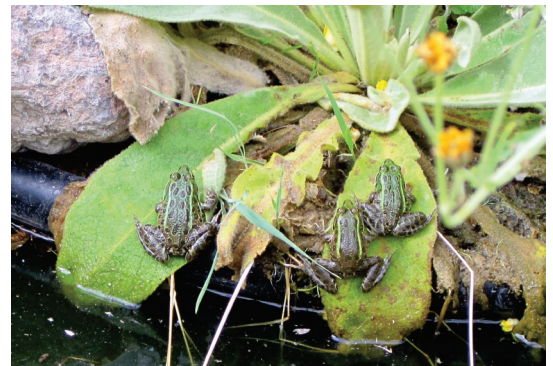
Juvenile frogs in outdoor enclosed pond

In 2010, the SWRS partnered with USFWS and AZGFD to reintroduce the frog back to the eastern side of the Chiricahua Mountains, where it had not been observed for over eight years. To accomplish this goal, we began a head-starting program at the station. Head-starting is a powerful tool used for stabilizing or re-establishing a species that has suffered a significant decline. Allowing animals to spend some of their early life-stages being cared for in a head-starting program can provide them with a greater chance of survival