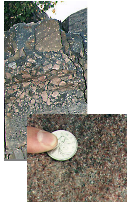
Gowganda Glacial Conglomerate

This rock is very even and consists mostly of the minerals quartz and feldspar. The fact that it's red tells us that it's been rusted. This rock is more than 2 billion years old.