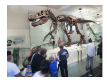
Museum View Virtual Tour

"See inside" the Museum in this virtual tour from Google Arts and Culture.